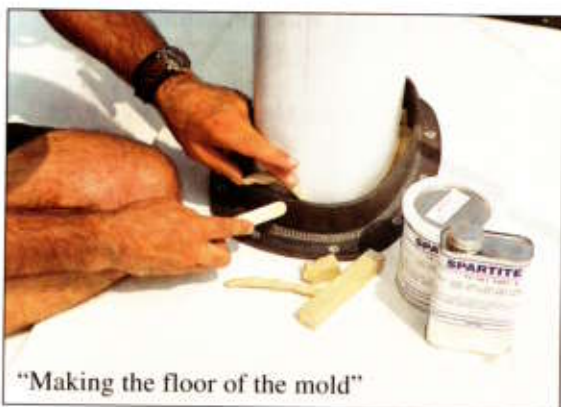
"Making the floor of the mold"